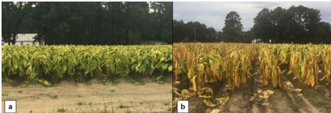
Figure 2—Leaf response to Hurricane Florence over a 72-hour period; a) Saturday, September 15th; and b) Tuesday, September 18th.